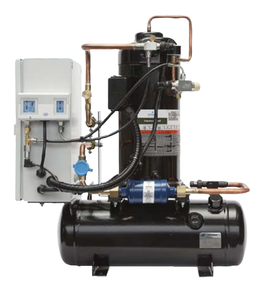
Digital Receiver Unit HLR