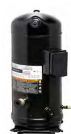
ZH*KCE Scroll Compressor for Heat Recovery

The range of products goes from the ZH40KCE (7.5hp) to the ZH150 (30hp) which can be tandemized.