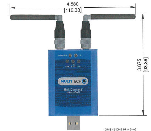
DIMENSIONS IN IN (mm)

With antennas attached, the dimensions are as follows. Refer to the user guide for more detailed dimensions.